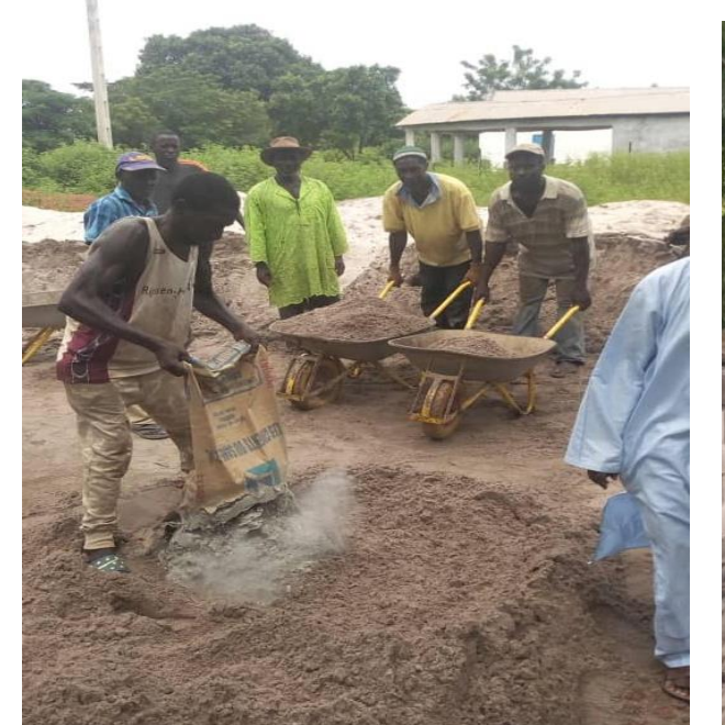
Exhibit 2 – teamwork- spirit of community participation at its best