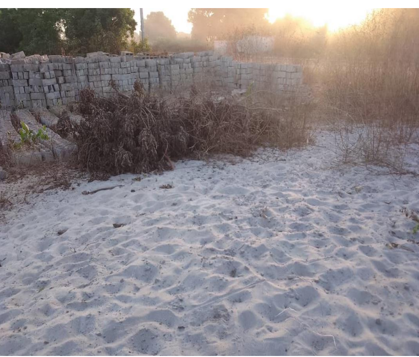
A selected photo of the sand with cement blocks visible in the photo