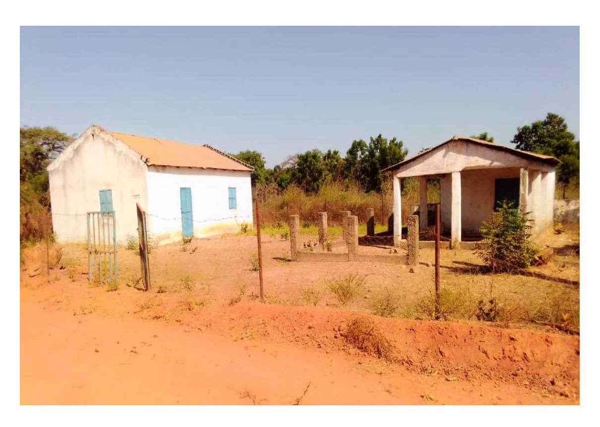
The 2 building in front of the site