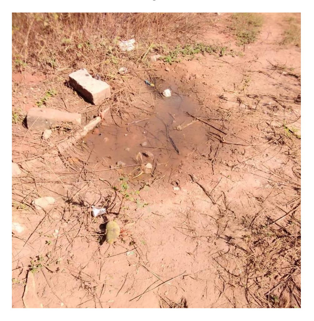
Broken stand tap; it is being fixed