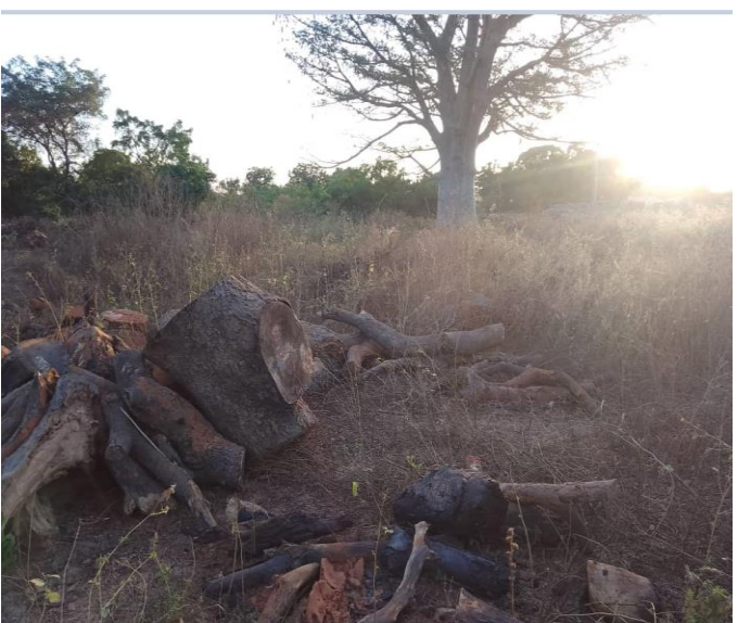
Selected photos to show that the site was cleared of shrubs and some of the neem trees