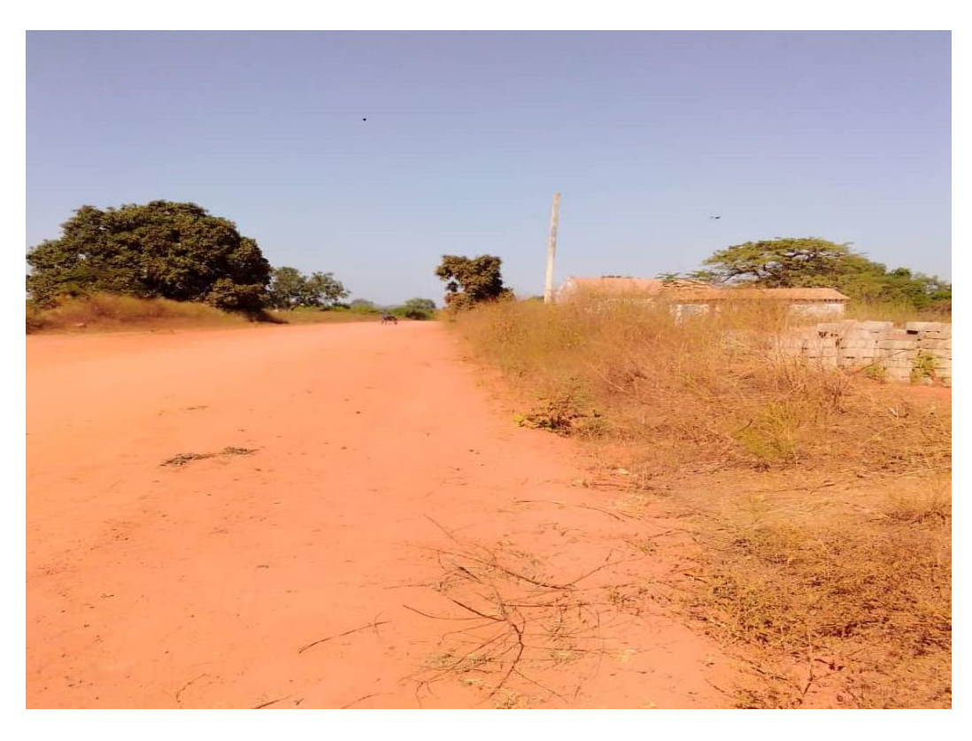
The site is on the left hand side of the main road to Sameh; the 2 buildings used for the baby clinic can be seen in the distance