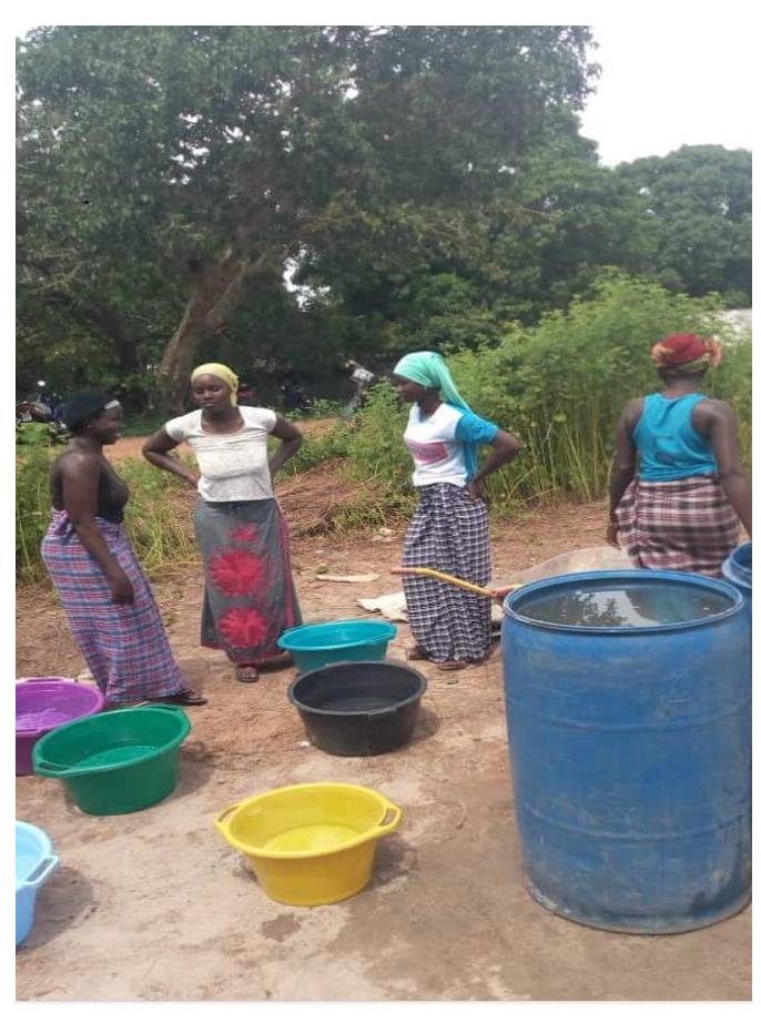
Women folks marvellously helping to supply water to mould the cement blocks