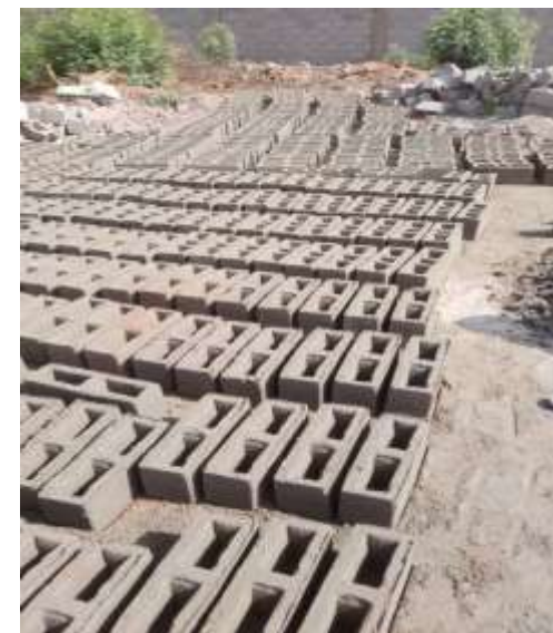
Activities prior to the awarding of the grant